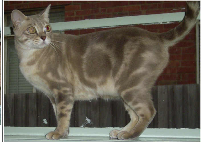
Blue Marble Adult