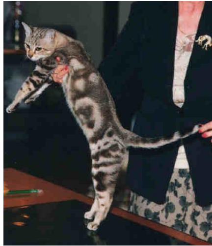
Brown Marble Kitten