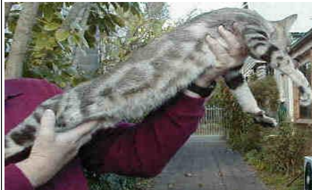
Same Brown Marble Kitten as an Adult